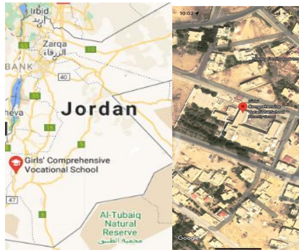
Figure 3: Location of Wadi Mousa High School for Boys.

Figure 3. The school consists of 1 building with a total area of 3035.8 m 2 . It contains a total of 13 classrooms, 7 laboratories, 5 administrative staff rooms, and 1 library. The building is typically operational during the government-mandated academic year, which runs from August 25 to June 20, encompassing 300 calendar days and 205 workdays (excluding weekends and public holidays). On weekdays, the building is open from 7:00 a.m. to 2:00 p.m., while it is closed on weekends and holidays.