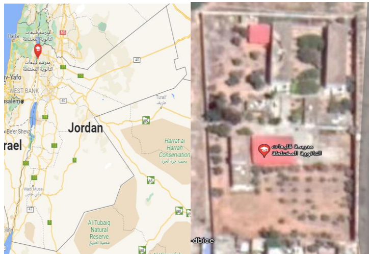
Figure 1: Location of Qali'at High School for Girls.

and 205 workdays (excluding weekends and public holidays). On weekdays, the building is open from 7:40 a.m. to 2:00 p.m., while it is closed on weekends and holidays.